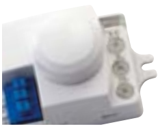
AVAILABLE WITH MICRO-WAVE OCCUPANCY SENSOR FITTED TO GEAR TRAY