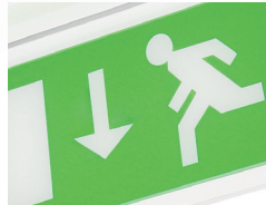
STANDARD LEGENDS AVAILABLE AS UP, DOWN, LEFT & RIGHT