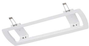
NEBRASKA SEMI-RECESSED MOUNTING KIT