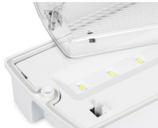
NEBRASKA HINGED GEAR TRAY WITH QUICK-RELEASE CATCHES