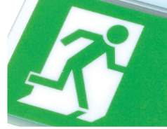
"MAN RUNNING THROUGH DOOR" V2 LEGENDS AVAILABLE AS UP, DOWN, LEFT & RIGHT