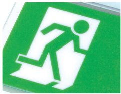
V2 LEGEND "MAN RUNNING THROUGH DOOR"