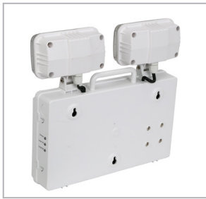
KEYHOLES ON REAR FOR WALL MOUNTING